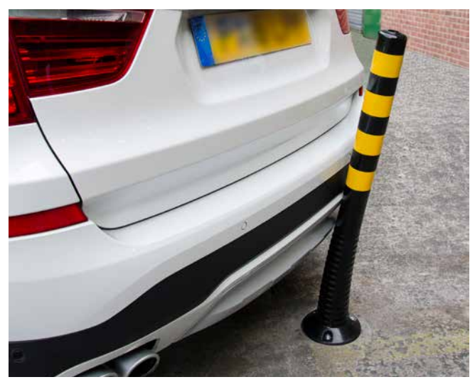
Another key part of external protection are floor mounted, which are designed to protect the building exterior and entrances from impact. Key for a school environment as using these at entrances help to prevent doors from swinging open in the wind.

Lets not forget building exteriors. The key safety requirements here is primarily pedestrian based. On the entrances, exits and throughout your car park, ensure you have speedbumps to help control the speed of vehicles entering and leaving your premises.